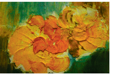
Application with structures in an oil-painting type: by using LUKAS Structure Pastes. More or less strong structures can be worked out on the surface, up to relief structures.

Application in a normal covering type: in the style of Gouache or Tempera painting in which covering colour surfaces are set side by side. Lightening of the colours by addition of White.